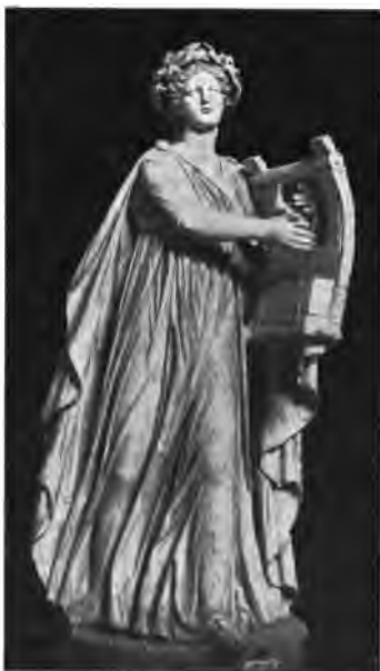
Fig. 17. Apollo as leader of the Muses.

Leto (La to'na). The story of his mother's wanderings, driven by the cruel jealousy of Hera to seek a birthplace for her children, and of how at last the little rocky isle of Delos 7 offered her a refuge, is told in the Homeric Hymn .